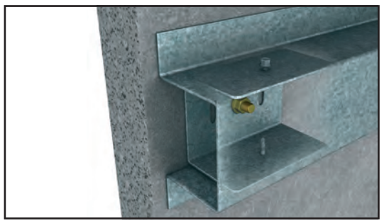
CLEAT TO CONCRETE