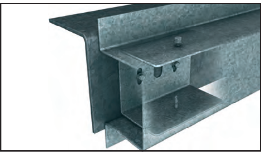
CLEAT TO STEELWORK

The images below show the basic fixing details for both the cleats and the attaching of the top hat profiles.